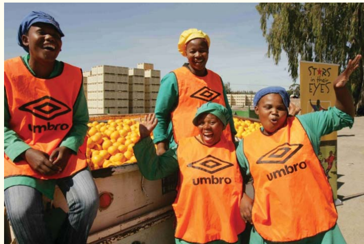
> Workers during the first project.

ON WEDNESDAY 30 MARCH 2011, COOL FRESH INTERNATIONAL HOSTED A MASS YOUTH TOURNAMENT FOR THE NOMASANTANQA DISADVANTAGED COMMUNITY IN THE SUNDAYS RIVER REGION IN THE EASTERN CAPE, ONE OF SOUTH AFRICA'S GREAT CITRUS PRODUCTION AREAS. THE EVENT WAS A CONTINUATION OF THE OUR COMMITMENT TO SOCIAL RESPONSIBILITY IN THE COUNTRIES AND REGIONS WHERE WE ARE COLLABORATING WITH GROWERS. THE AFOREMENTIONED TOURNAMENT COINCIDED WITH THE VISIT BY A SPECIAL DELEGATION FROM EUROPE.